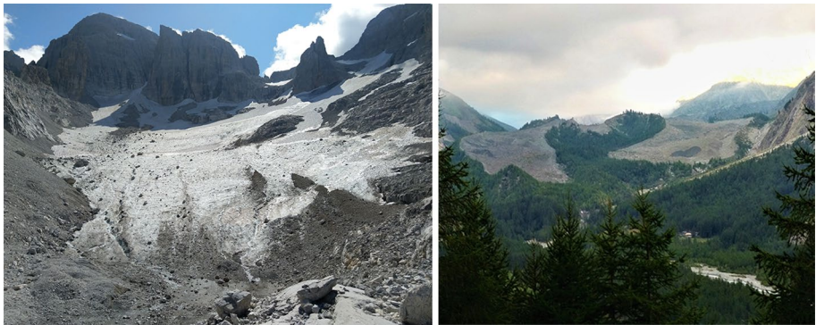
Fig. 1 On the left a vanishing debris-free glacier (Vedretta d'Agola, Brenta Dolomites—Italian Alps); on the right a debris-covered glacier with the tongue extending below the treeline (Miage Glacier, Mount Blanc Group—Italian Alps)

Glaciers are the most evident cryosphere feature in the European mountains. According to the amount of debris cover on their surface, glaciers can be divided into debris-free and debris-covered glaciers (Fig. 1) (Azzoni et al. 2018; Tielidze et al. 2020). Debris-covered glaciers are ice bodies where the largest part of the surface is covered by debris, which deeply influences glacier surface energy budget, ablation rates, long-term volume and surface variations (see Diolaiuti et al. 2019; Fyffe et al. 2019; Fugazza et al. 2019). Glacier-related landforms include glacier forelands and associated landforms (e.g. moraine ridges) and glacier-fed streams, ponds and lakes.