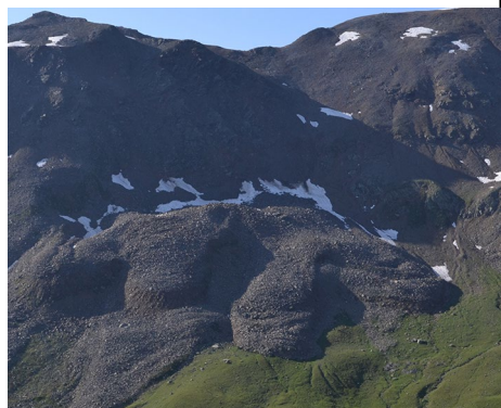
Fig. 2 A Rock glacier with its typical lobate tongue (Lago Lungo, Ortles-Cevedale Group, Italian Alps)

Rock glaciers (Fig. 2) are the most evident and widespread permafrost landform in many mountain areas, including the European mountains, particularly where the climate is cold and dry. A rock glacier is a lobate or tongue-shaped landform consisting of coarse debris with interstitial ice or ice-core, characterized by creeping movement due to ice deformation (Haeberli et al. 2006; Janke et al. 2013). The occurrence of subsurface ice in debris deposits is promoted by the prevalence of coarse blocks over the fine matrix, a grain-size distribution causing a cold thermal regime partially decoupled from that of the surrounding atmosphere (Juliussen and Humlum 2008; Tampucci et al. 2017a; Brighenti et al. 2021).